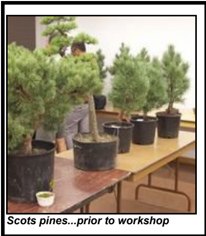
Scots pines...prior to workshop

We were lucky to have plant material with some bonsai potential for this workshop: not only the trees were good, but so were the instructors who lent their experience to work with less experienced members to produce some fine results. It was a rewarding workshop for both the participants and the observing members who stuck around to watch the process of turning nursery stock material into prospective future bonsai. We just hope that these trees will one day be displayed at our shows.